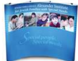
The JFS Alexander Institute display is a traveling display complete with information about the Alexander Institute.

With the input of many individuals and families throughout Greater Houston, the Alexander Institute has not only begun to identify the extent and scope of needed services, but has also initiated programs and services to begin to address the needs. Understanding the breadth of special needs in Jewish families is critical to our planning and implementation of additional services and programs. If you—or someone you know—has special needs, please complete and mail the following confidential questionnaire to JFS. The questionnaire is also available on-line and may be accessed at www.jfshouston.org . If you wish to speak with someone about your situation, call Jewish Family Service at 713-667-9336 and ask to speak with a member of the Alexander Institute staff.