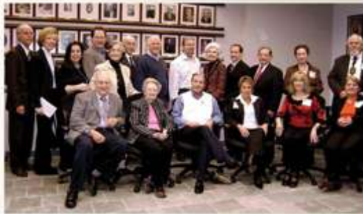
Members of the Past Presidents' Council and family members of past presidents in the JFS board room during the evening of the Hanukah Candle Lighting.

Thanks to donors, attendees and those who supported the ad journal, this was the most successful fundraising event in Jewish Family Service history.